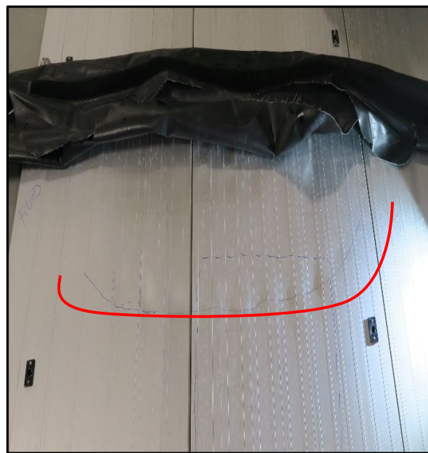
Figure 2 – Ruptured keel bladder and the view of the underside of the metal hull. The red line has been added to highlight the deformities in the hull metal due to the keel bladder rupture.

An investigation has identified that the keel bladder suffered a rupture due to excessive pressure in the tube. The recommended operating pressure by the manufacturer is 3.4 pounds per square inch (p.s.i) or 240 millibar pressure (mb). An on-scene survey of multiple inflatables on board the cruise ship noted pressures up to and exceeding 9 p.s.i. (620 mb) in other keel bladders. The keel bladder is not protected by a safety relief valve, and the manufacturer recommends that they be inflated with a foot pump to reduce the chance of over-pressurization. However, crewmembers were routinely using an air compressor to fill the buoyancy chambers (including the keel tube) prior to the incident. In addition, pressure levels were not being checked using a manometer as recommended by the manufacturer.